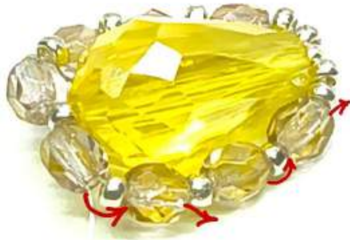
1 Miyuki RR 11/0