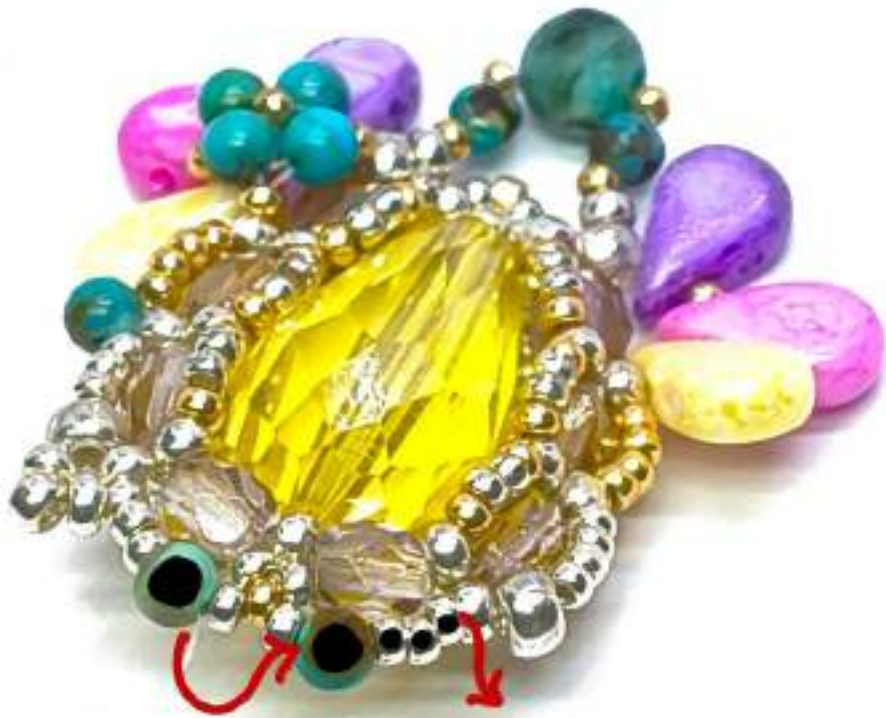
2 Miyuki RR 8/0