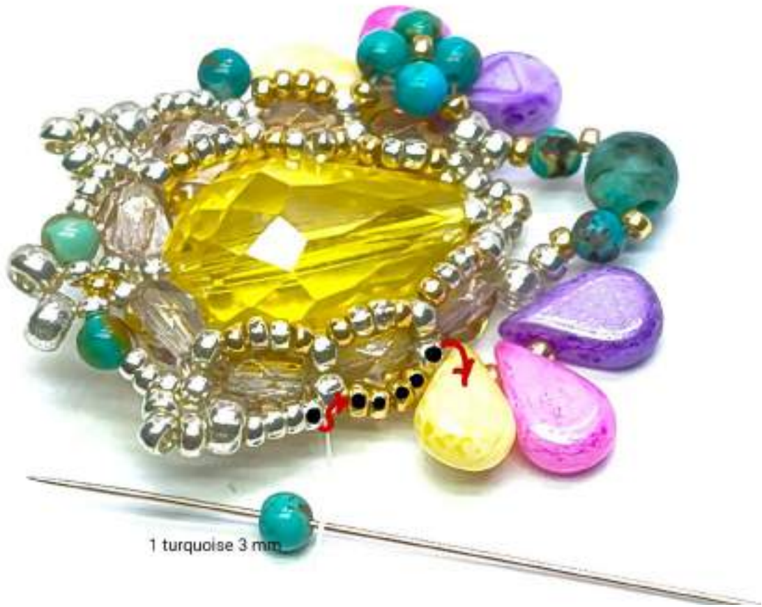
1 turquoise 3 mm