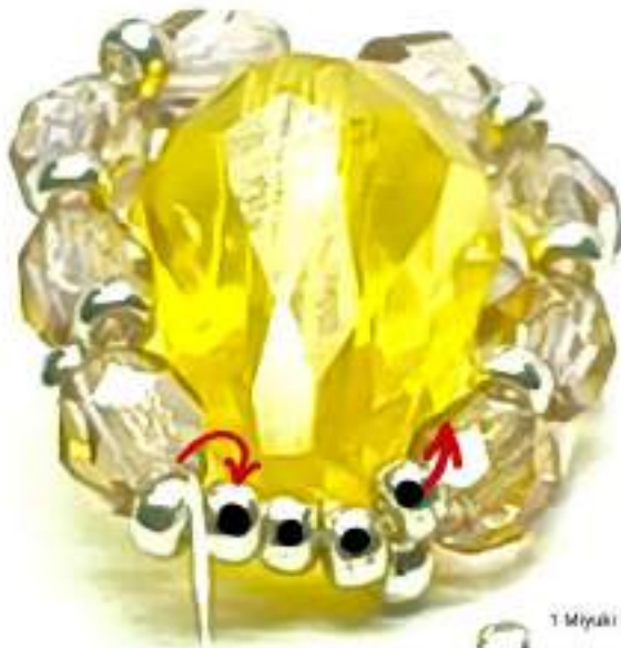
1 Miyuki RR 11/0